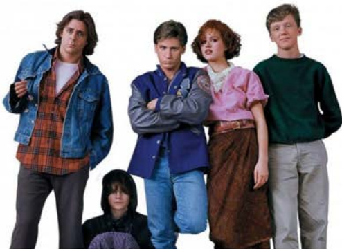
The Breakfast Club, 1985

Join us for an evening of 80s music & nostalgia, food, tasty beverages, fun, and more!